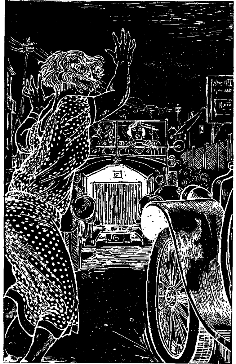
'That woman rushed into the road just as a car was coming the other way.'

'Daisy wouldn't stop,' Gatsby explained. 'Then she felt faint and I drove home. I'm waiting here now in case Tom makes any trouble.'