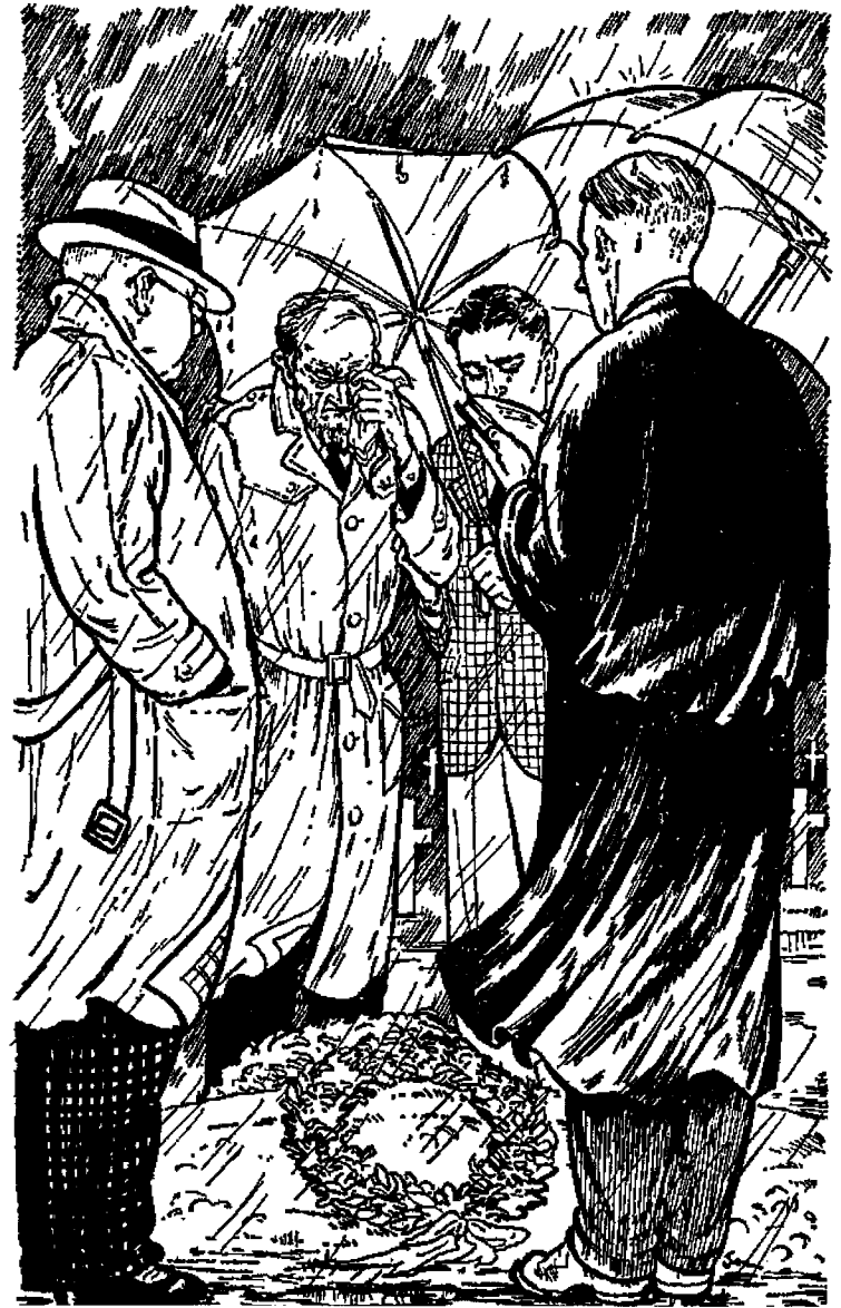
As we stood by the grave, I saw that Daisy hadn't sent a flower or a message.

After the funeral, the fat man said, 'I'm sorry I couldn't get to the house.'