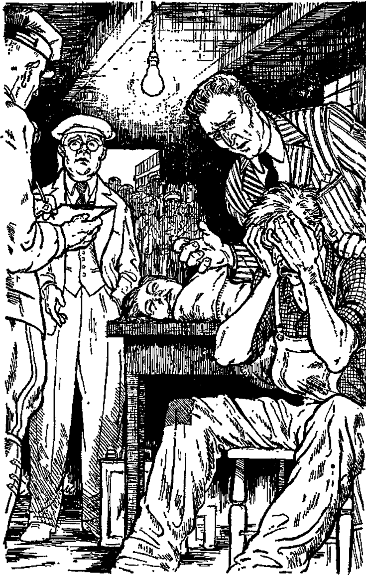
Inside the garage, someone was crying, 'Oh, my God, oh, my God,' over and over again.

here. That yellow car I was driving this afternoon wasn't mine, do you hear?'