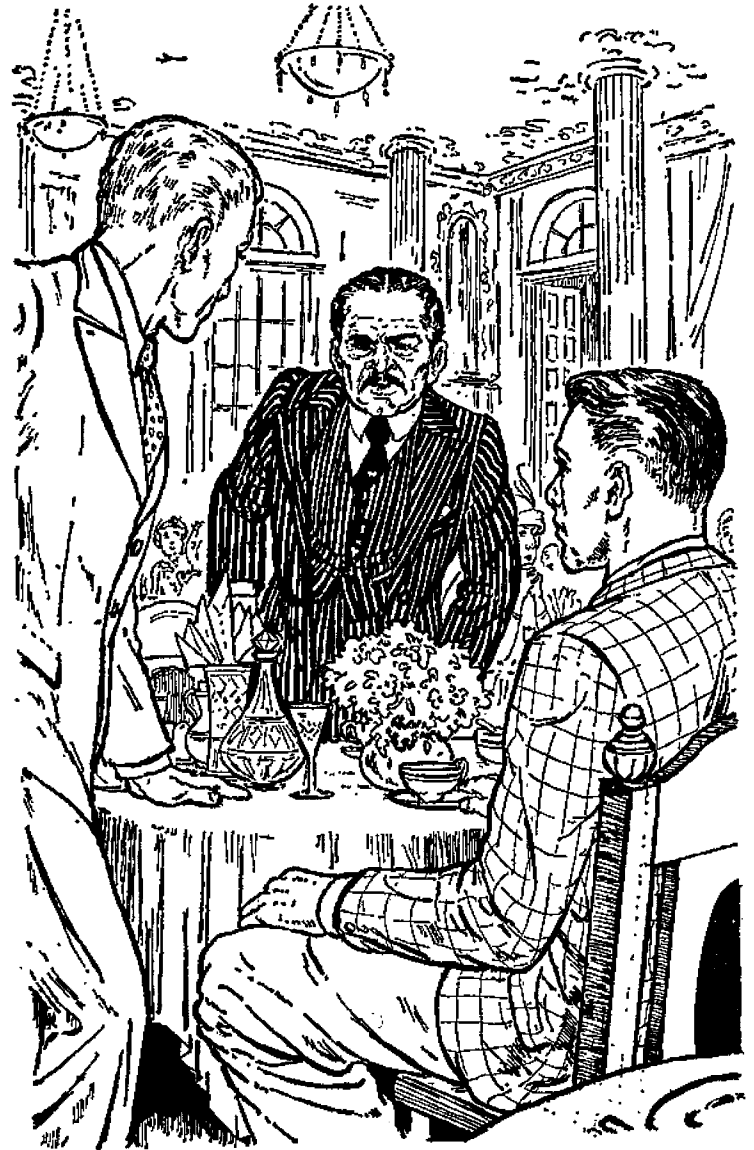
When Gatsby came back to our table, Mr Wolfsheim got to his feet and looked round the room.

'This is Mr Gatsby, Mr Buchanan,' I said.