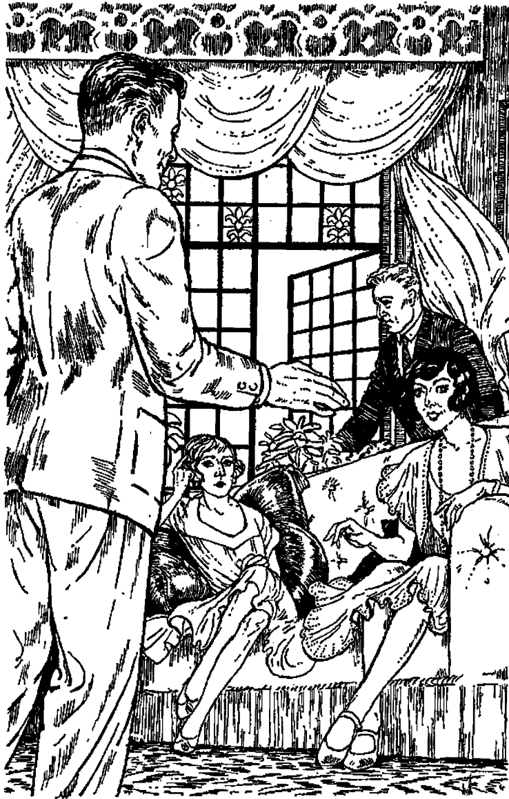
Two young women were sitting on an enormous couch.

slim, with grey eyes and a pale, unhappy face. I was sure I had seen her before.