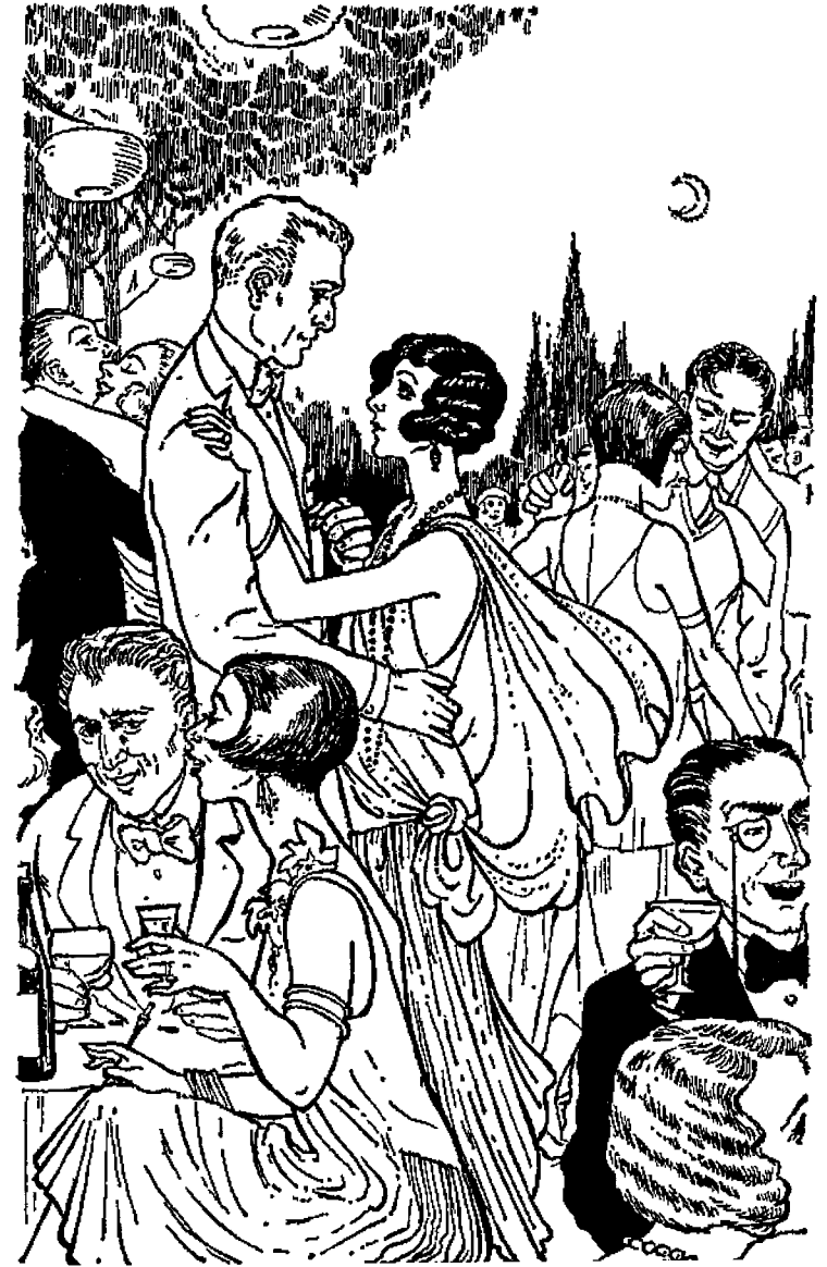
Daisy and Gatsby danced together.

As they got into their car, Daisy looked back at the house