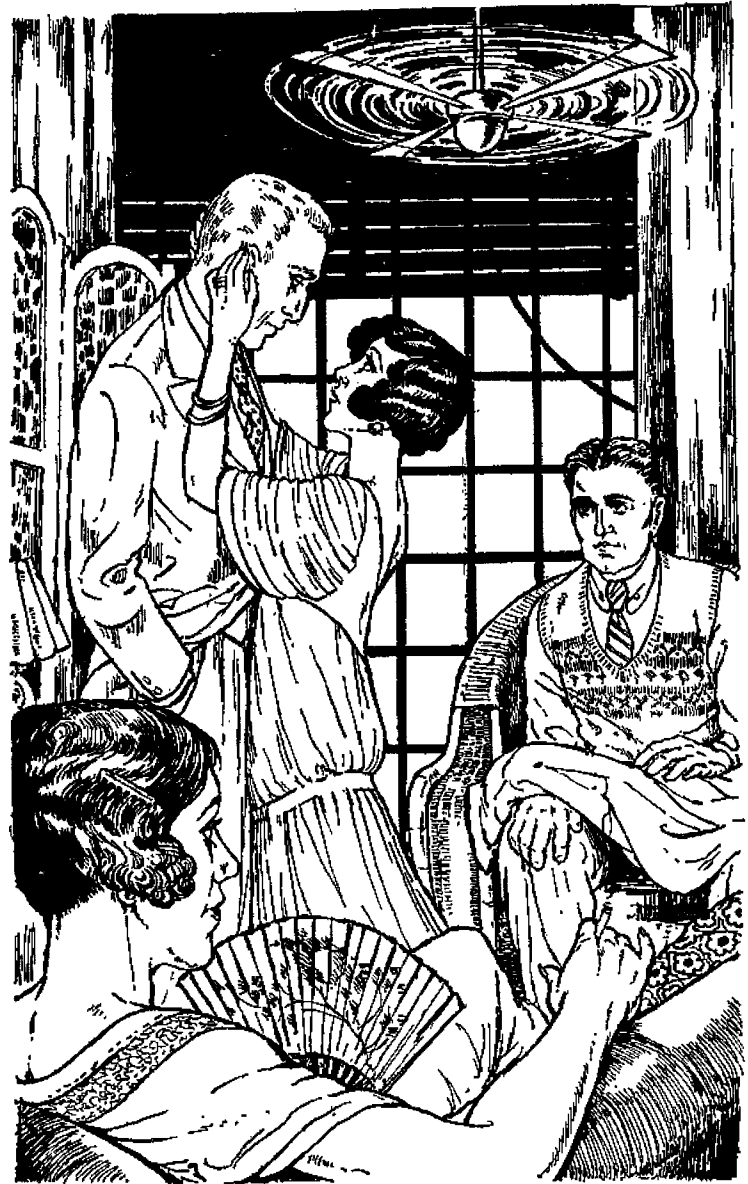
'You know I love you,' she said softly.

Suddenly, Tom Buchanan understood. His wife, Daisy,