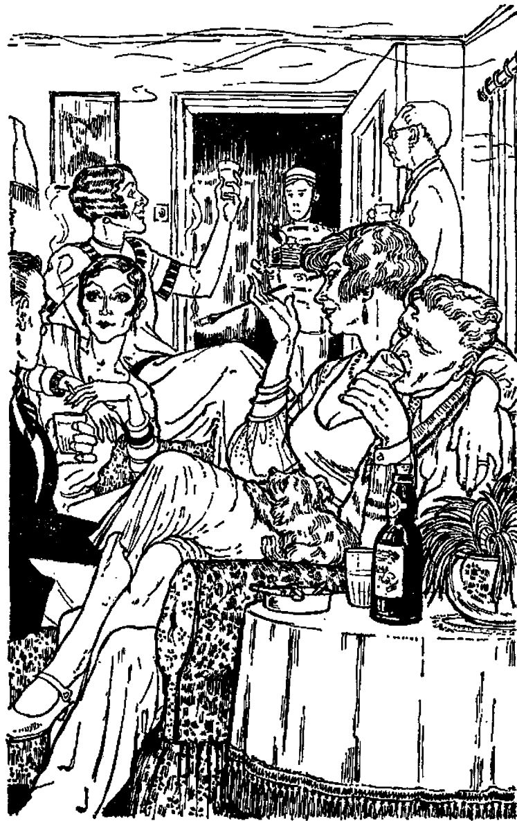
The room was filled with Myrtle's loud, false laughter.

lay on the couch. Her nose was still bleeding and she was crying loudly.